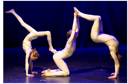
The Flying Femmes, Dunedin Fringe 2023

Many events are on weekend nights starting at 8pm. Consider an early or late session to give audiences more options. Sunday, Monday, Tuesday and Wednesday nights have less competition. We highly recommend you ensure your show(s) is finished by 4pm on the final day of the festival (Sunday March 24) , as we want to see y'all at the Fringe Awards!