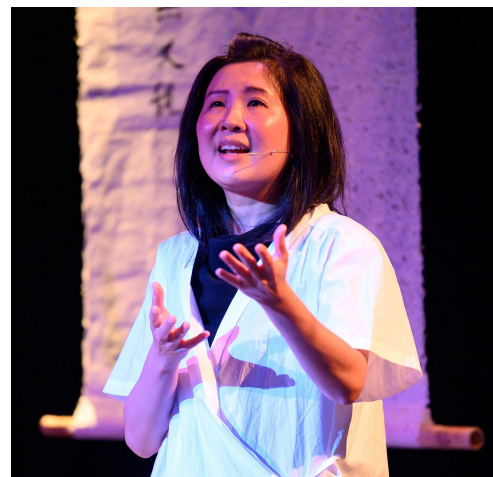
愛, 媽媽 (Love, Mum), Dunedin Fringe 2023

You are responsible for administering door sales, although your venue may offer full front of house facilities (make sure you ask them about this when you organise the hire). We may be able to find you a volunteer to do front of house for your event (we'll do a call-out to registered events to submit their volunteer requests).