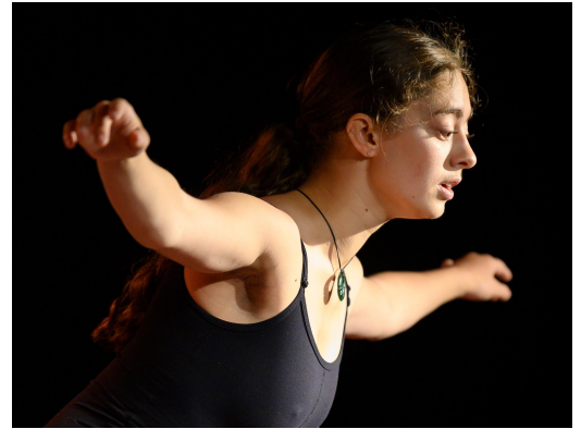
TwentyNineteen, Dunedin Fringe 2023

In order to be considered for a Fringe Artist Award, you must opt in – there’s a tick box in the About You + Your Team tab of Eventotron. Dunedin Fringe recruits Awards judges – who have knowledge and expertise in a diverse range of artistic genres – and arranges comp tickets for them to attend events that have indicated they want to be considered for awards.