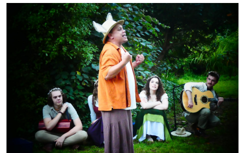
The Barden Party, Dunedin Fringe 2022