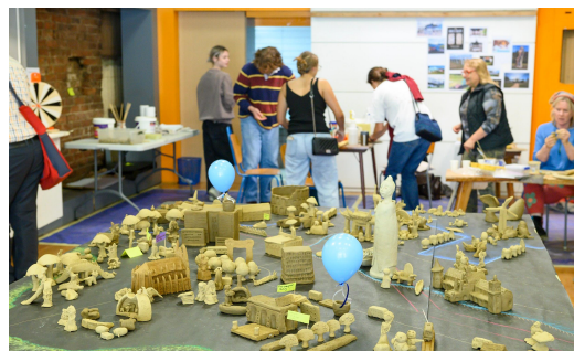
City Planners, Dunedin Fringe 2023

Contact us if you need venue suggestions or advice.