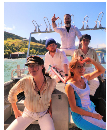
Sea Shanties and Salty Stories, Dunedin Fringe 2022

*Payment of the registration fee/bond also incurs a $4 processing fee.