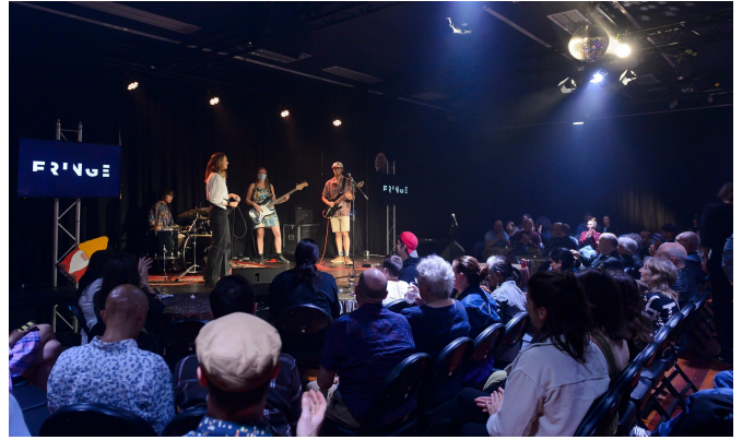
Third Wheel, Dunedin Fringe 2023

For the duration of Fringe, it is a (subsidised) venue for hire with 6pm and 8pm shows daily, and late shows Thursday to Saturday. You can apply to use Te Whare o Rukutia as your venue during Fringe within Eventotron. Capacity is 120 seated, and hire includes house tech, technician, bar, and Front of House.